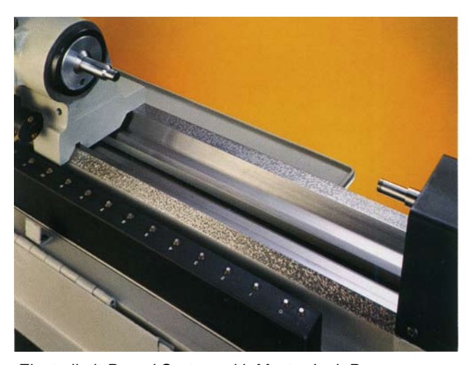
Electrolimit-Based System with Master Inch Bar